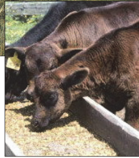
Across-the-fence weaning (above) with strategically placed feed bunks (left), or just utilizing one of the area's growyards might be weaning options to consider.